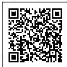
BELLAL HOSSAIN MONDAL