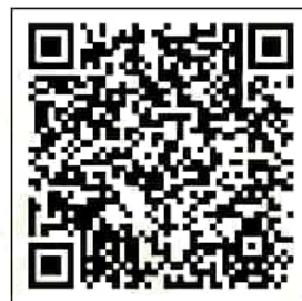
BELLAL HOSSAIN MONDAL