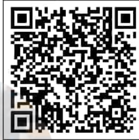
BELLAL HOSSAIN MONDAL