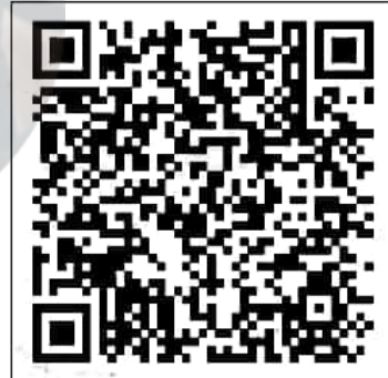
BELLAL HOSSAIN MONDAL