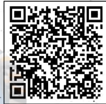
BELLAL HOSSAIN MONDAL